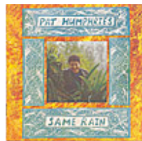
Cover for Humphries' first CD, Same Rain Moving Forward Music IBSN: MFM 360