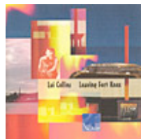
Cover for Lui Collins' CD Leaving Fort Knox Molly Gamblin Music IBSN: MGM 1006